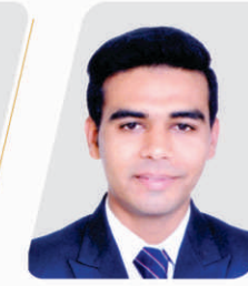
Israh Sabjifaros A'bad Int. Airport