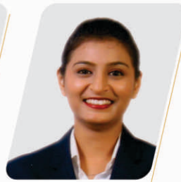
Miral Patel Go Air