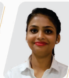
Yakuta Mandviwala Cabin Crew - Go Air