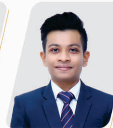
Utsav Bharucha Mumbai Int. Airport