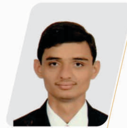
Deep Joshi Go Air