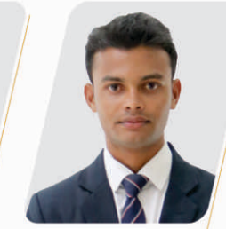
Umesh Roat Ahmedabad Airport