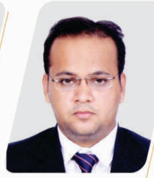
Aakib Shaikh A'bad Int. Airport