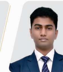
Stanley Nadar A'bad Int. Airport