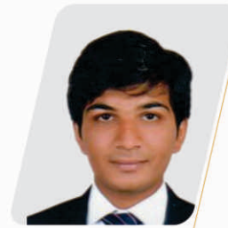
Om Karamta Go Air