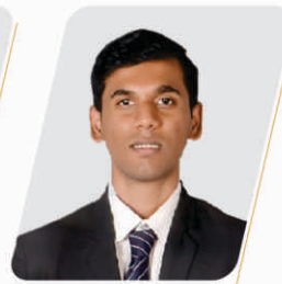
Akshay M. Bangalore Airport