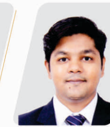
Pulin Shah A'bad Int. Airport