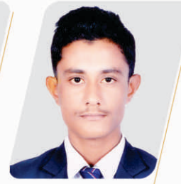
Ahmed Ansari A'bad Airport