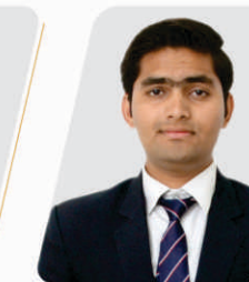
Juned Buraniya Ahmedabad Airport