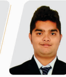
Dipen Shah A'bad Int. Airport