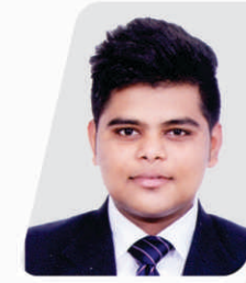
Harsh Shah A'bad Int. Airport