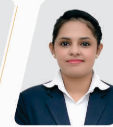
Khalidabanu Pathan A'bad Int. Airport